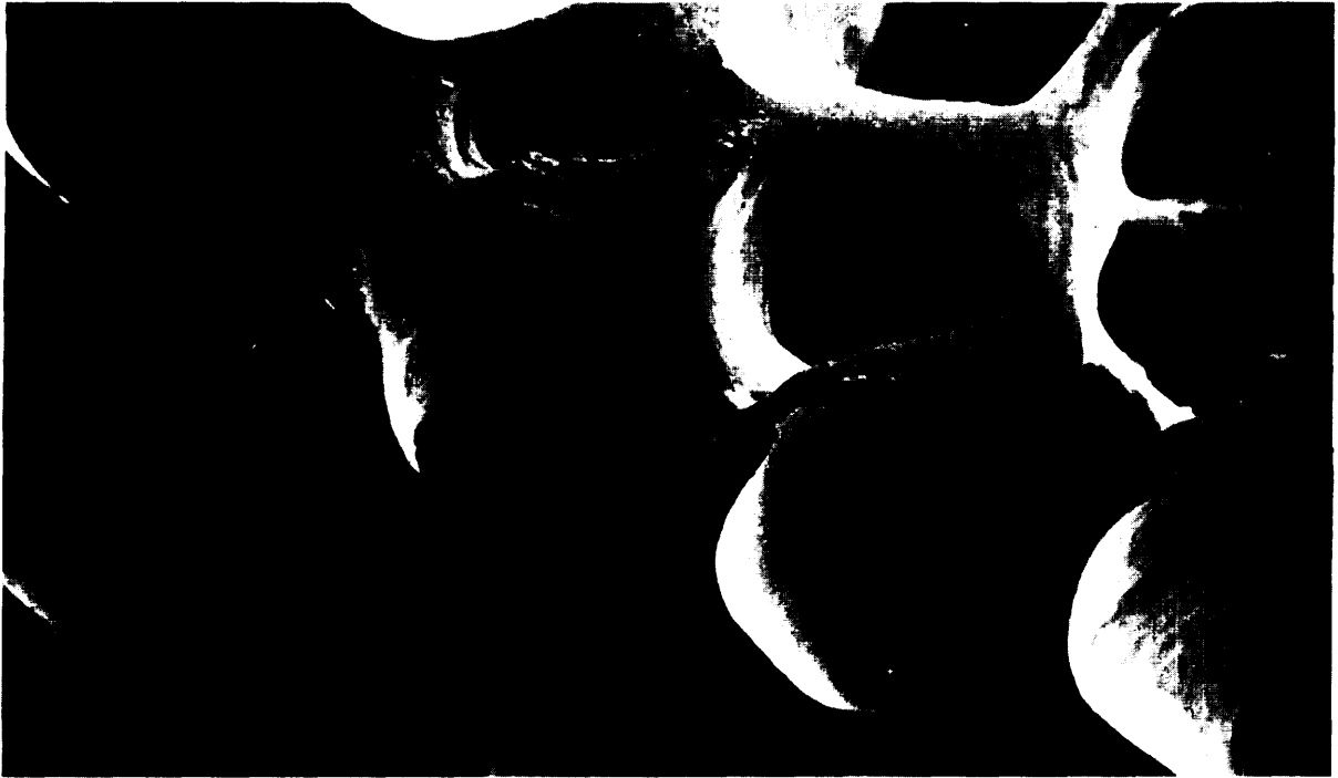
FIGURE 1: Normal Bone and Osteoporotic Bone